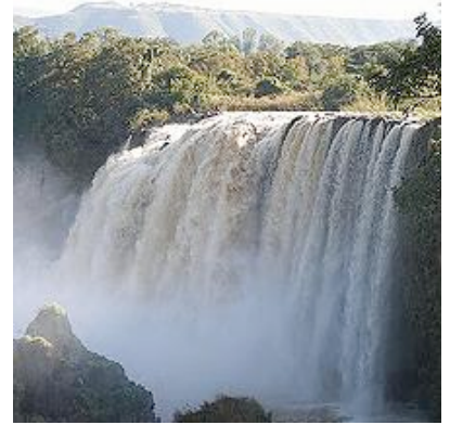
Blue Nile Falls, Ethiopia Kully Balaagan

But things went wrong for the Greenpeace ship on the first day of its mission. Instead of following the