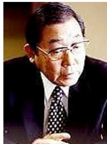
Minoru Morimoto heads the Institute of Cetacean Research

"The number of whales taken in Japan's research program is far below the potential biological removal (an estimate of the maximum number of animals that can be removed from a population – not including natural mortalities, while still allowing that stock to maintain its optimum sustainable value) for the species," according to the Institute of Cetacean Research in Tokyo, which carries out Japan's whale research program in the Antarctic and western North Pacific.