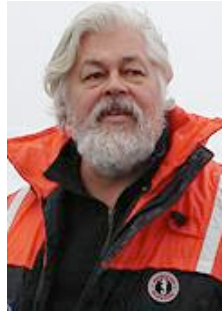
Sea Shepherd founder Captain Paul Watson

"Despite inflammatory statements to the contrary and misrepresentations from the public relations flaks for the outlaw Japanese whalers, the Sea Shepherd Conservation Society has no intention of ramming any Japanese whalers on the high seas," he said today.