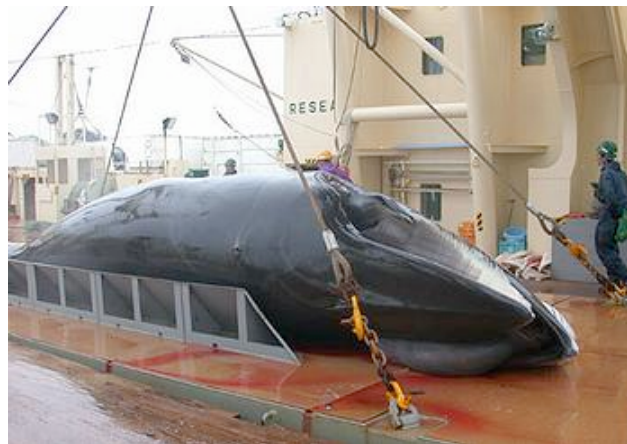
A dead minke whale aboard a Japanese whaling vessel.

Japan has announced that the fleet intends to kill 50 endangered fin whales, 50 threatened humpback whales and 935 minke whales this season.